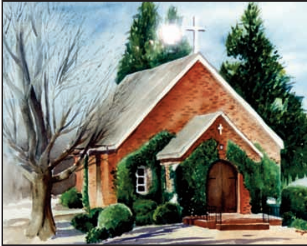
Main entrance of St. Luke's opening onto South Scott Street.

St. Luke's was a mission church from its beginning, served by priests from Huntsville's Church of the Nativity. During the years of World War II, seminarians from the School of Theology at Sewanee served St. Luke's. The congregation called its first rector in 1961, and St. Luke's became an independent parish in the 1980's.