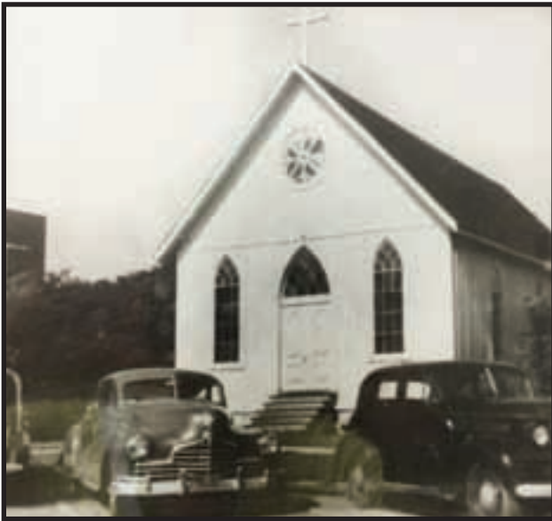
The original Gothic wood frame church on North Broad Street.

Episcopalians have worshipped in Scottsboro for over 155 years. Services were conducted during the 1850's in private homes, a school building, and a building shared by other churches. Services were often held on Sunday afternoons, conducted usually by priests from the Church of the Nativity in Huntsville, our "mother church."